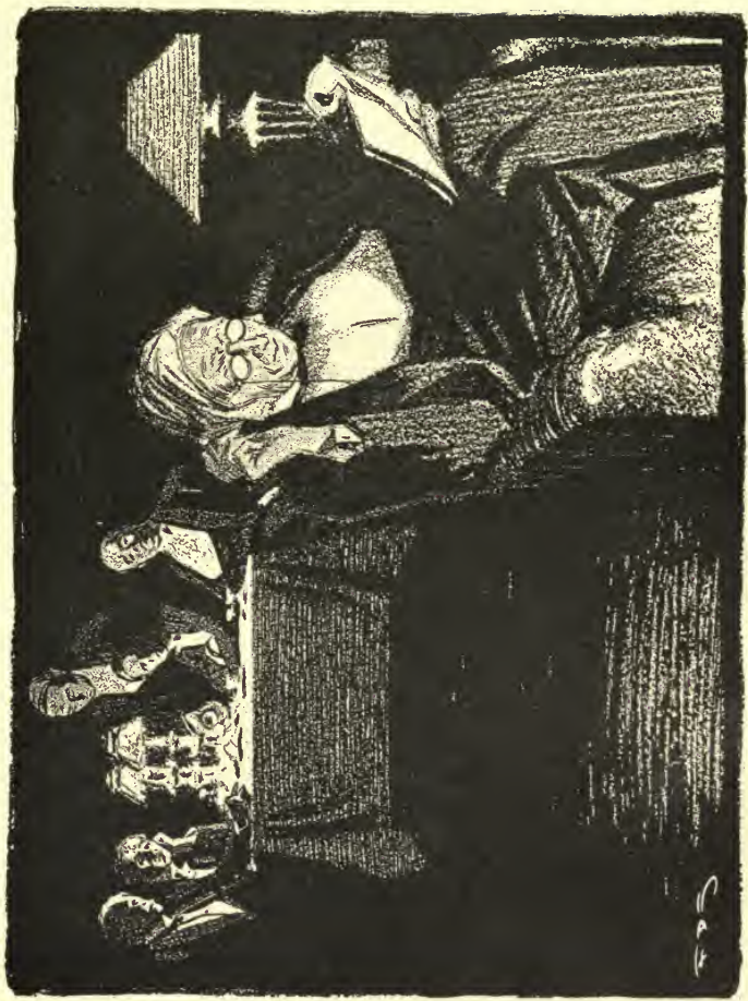
The men around the table turned and glanced toward the gentleman in front of the fireplace.